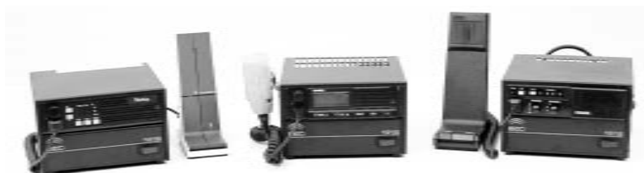
SEC-1212 shown with custom cabinets for Motorola Radius, Vertex FTL-1011 and Maxon SM2000